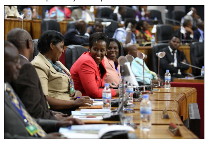
Umushyikirano 2013, Rwanda Parliament , 6-7 Dec 2013

• Establishing project advisory or steering committees: To ensure an activity is relevant to the context, some programs have instituted advisory or steering committees from the legislature or parliament and sometimes with additional representatives from academia, think tanks, and political parties to assist in advising and guiding project interventions. These committees may present insights useful to the analysis of the political economy, and can be particularly useful to engage when an activity is not gaining results as anticipated.